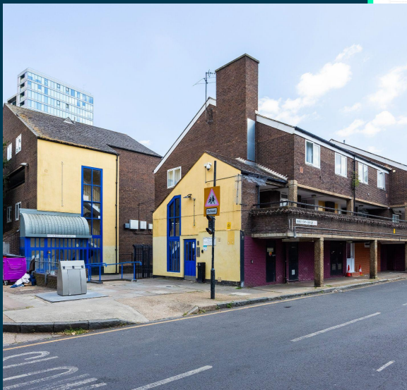
Rounton Road, London, E3