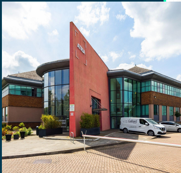
Atria House, Bath Road, Slough, SL1