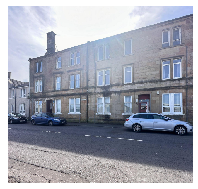
Outlay figures based on assumed cash purchase of £50,000.